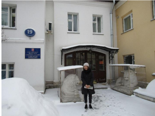
Department of Cultural Heritage of Moscow