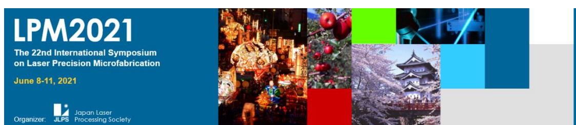
Banner of LPM2021 ( http://www.jlps.gr.jp/lpm/lpm2021/ )

In this report I will share my experience at the 22 nd International Symposium on Laser Precision Microfabrication (LPM2021). This annual conference is where scientists and engineers working in the field of photonics gather to share leading-edge fabrication technologies and discoveries providing insight into the complex phenomena of laser processing. Although it is custom for the LPM to be held in different nations such as Japan, Scotland, Germany and the USA, this year's conference was held online due to the COVID-19 crisis. Nevertheless, many enthusiastic researchers showed up to share their latest results, and it was an exciting 4 days of intensive learning and communication. Here I will share a detailed report on the newest trends in both fundamental research and application that I learned by listening to various presentations. I had the honor to hold discussions (including light Q&A's) with all of the presenters mentioned in this report.