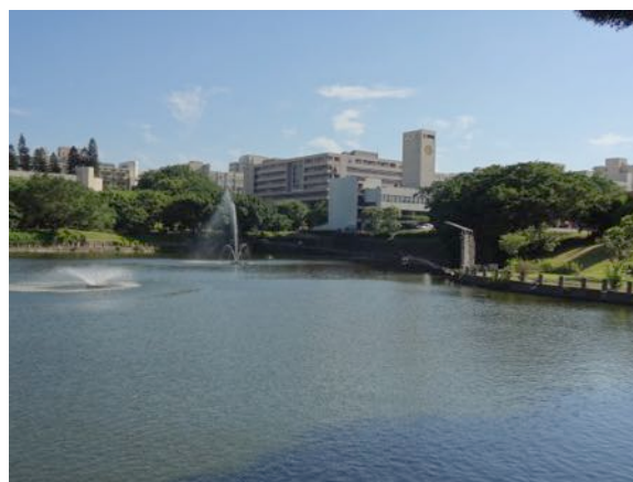
Campus view of National Chiao Tung University.