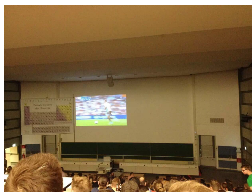
(left) Outside Allianz Arena at Munich. (right) Watch European Football Championship at the University of Muenster.